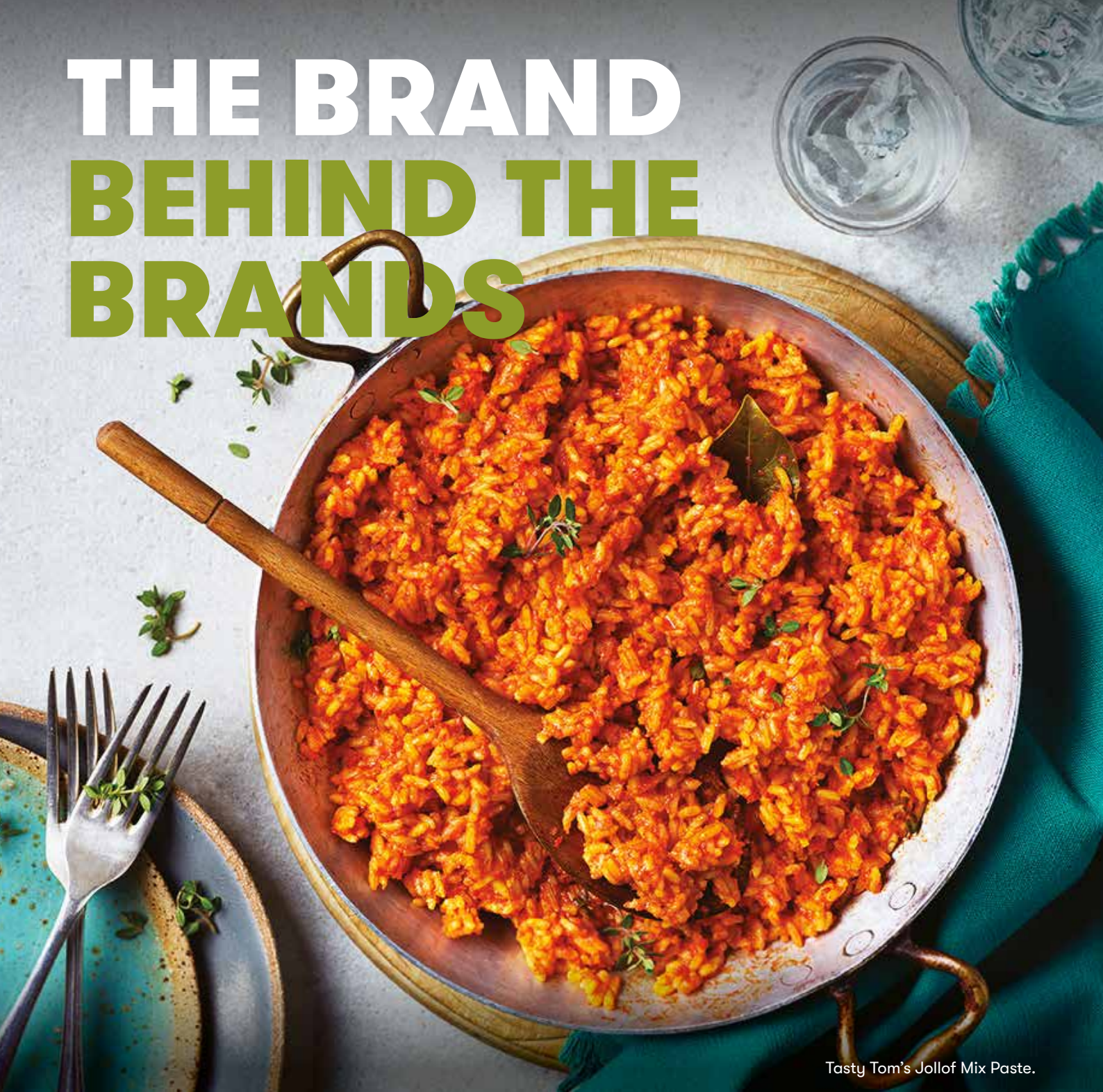
Tasty Tom's Jollof Mix Paste.