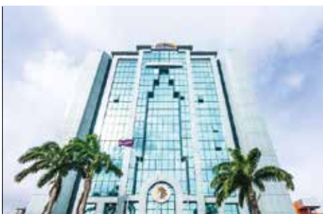
The headquarters of Africa Re in Victoria Island, Lagos.

The Corporation conducts regular training and provides targeted technical assistance to industry stakeholders for relevant capacity building. This was recently complemented by the Young Insurance Professional Programme that