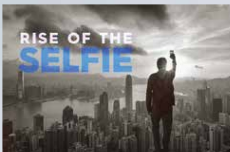
TECNO branded film The Rise of The Selfie on YouTube

Globally, TECNO is undoubtedly a dark horse that is championing the African market while gaining significant momentum and robust growth world-wide. So what makes TECNO a brand most admired by Africa? In a world driven by the rise of social media and young users, what is TECNO's strategy to hold on to and strengthen its leadership among future users? And what can we expect from the brand?