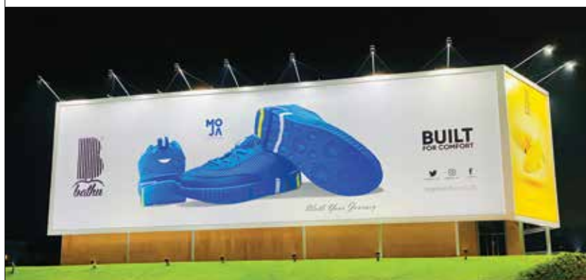
Above: South Africa's Bathu brand is taking Africa by storm, entering the Most Admired African Brands table at #10.

ing private sector brand at #2, in a private sector list where all multinational mobile operators in Africa – Vodafone Group (#3), Orange (#4), Airtel (#6) – and media brands Facebook (#10) and DSTV (#24) made the list of the Top 25. Unsurprisingly, the leading pharmaceutical groups, Johnson & Johnson (#12) and AstraZeneca (#25) feature, but Nigeria's Dangote (#8) is the only industrial brand in the list.